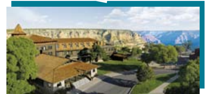
Xanterra's El Tovar Resort, on the rim of the Grand Canyon

For more information, visit www.GrandCanyonLodges.com or www.facebook.com/GrandCanyonJobs .