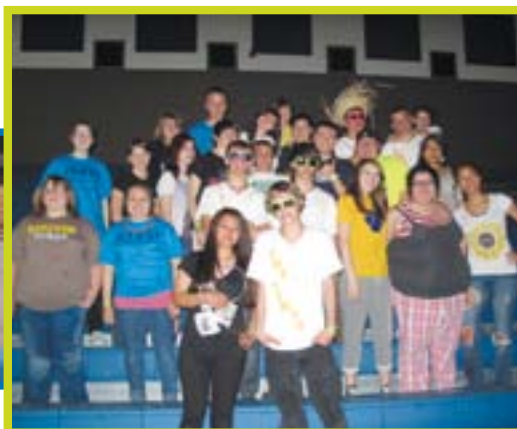
By seven in the morning, participants are finally able to stop dancing and celebrate a night well done.